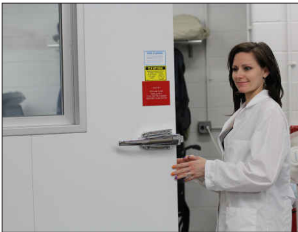
A lab faculty member opens the chamber door to setup a test.