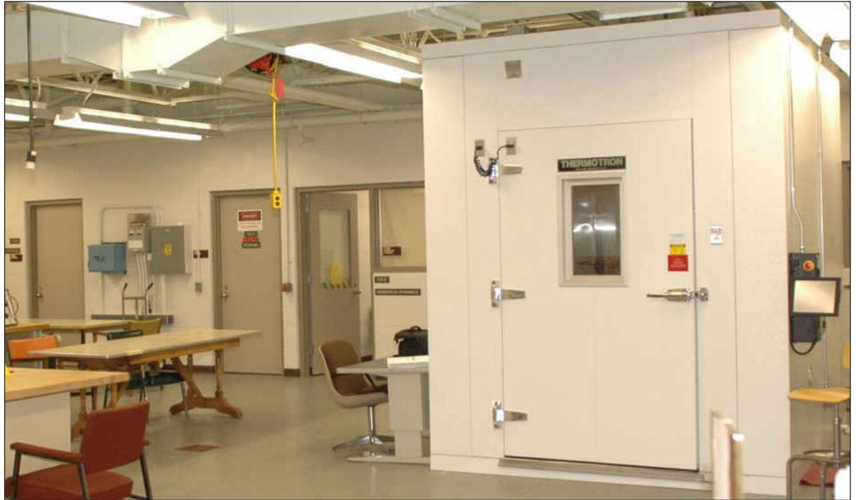
The Thermotron Walk-In Chamber in the Apparel Merchandising and Design Body Scanning Lab at Central Michigan University in Mt. Pleasant, Michigan.