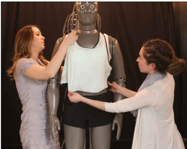
Two faculty members prepare a Thermal Manikin for a temperature and humidity environmental test in the Thermotron Walk-In Chamber.

With all of these innovative testing technologies and a renowned reputation, multi-national companies commission the Lab to perform temperature and humidity tests on their products with the Thermotron chamber. The Lab has worked with companies such as Adidas and Reebok to improve the quality and reliability of their products, as well as to provide an environment to design newer products. When performing tests for companies, the faculty research team meets with company representatives to determine testing objectives and procedures. Following the tests and the analyzed results, companies can decide whether product improvements are necessary, or if their product is ready to go to market.