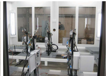
Modular Burn Chamber Left: Outside (back) view Right: Inside view, toward windows