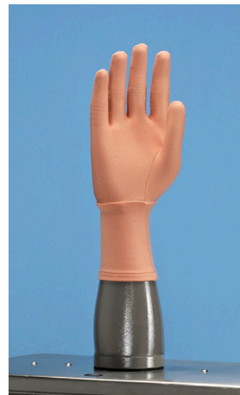
Shown with wicking fabric sweating skin

All Hand systems are complete, ready-to-use instruments including manikin, control electronics, laptop PC, and our exclusive ThermDAC control software. Just add your own climate chamber for a comprehensive testing solution.