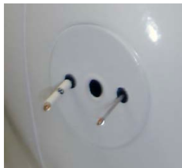
Combination temperature and windspeed sensor, with protective cap removed